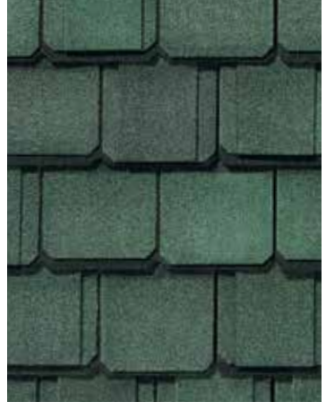
Gatehouse Slate Stonegate Gray