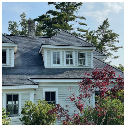
Stormy Gray Blend