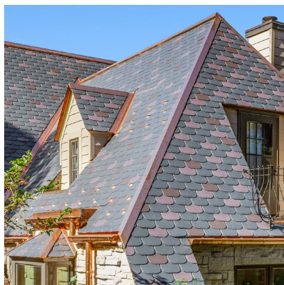
Midnight Gray, Mountain Plum and Chestnut Brown (Beavertail)